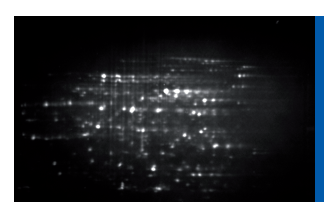
Protein detection after Western blotting on membrane

Analysing large-format, horizontal 2D gels by immunodetection has not been possible until now or only under very difficult conditions. The support film which is necessary to stabilize the gel during all handling processes in 2D gel electrophoresis makes a semi-dry blot impossible. Until now, the separation of gel matrix and support film was only possible by a laborious mechanical procedure, which often resulted in the gel with the separated samples being more or less destroyed.